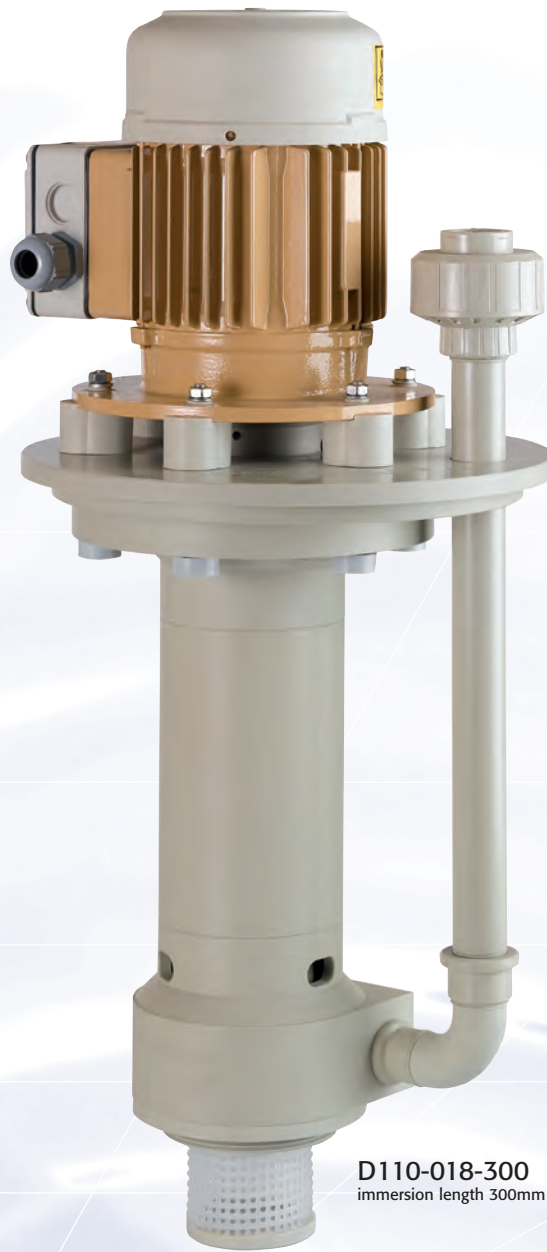
D110-018-300 immersion length 300mm